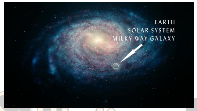
Location of the Solar System in the Milky Way